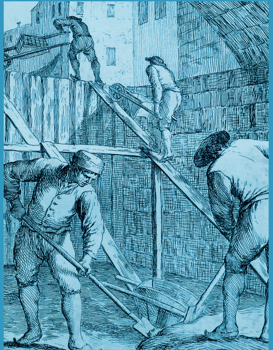
Image: Canal dredgers (det.) da Le arti che vanno per via nella città di Venezia di Gaetano Zompini, Venice 1753.

Ca' Foscari - Sala Marino Berengo Dorsoduro 3246, Venice